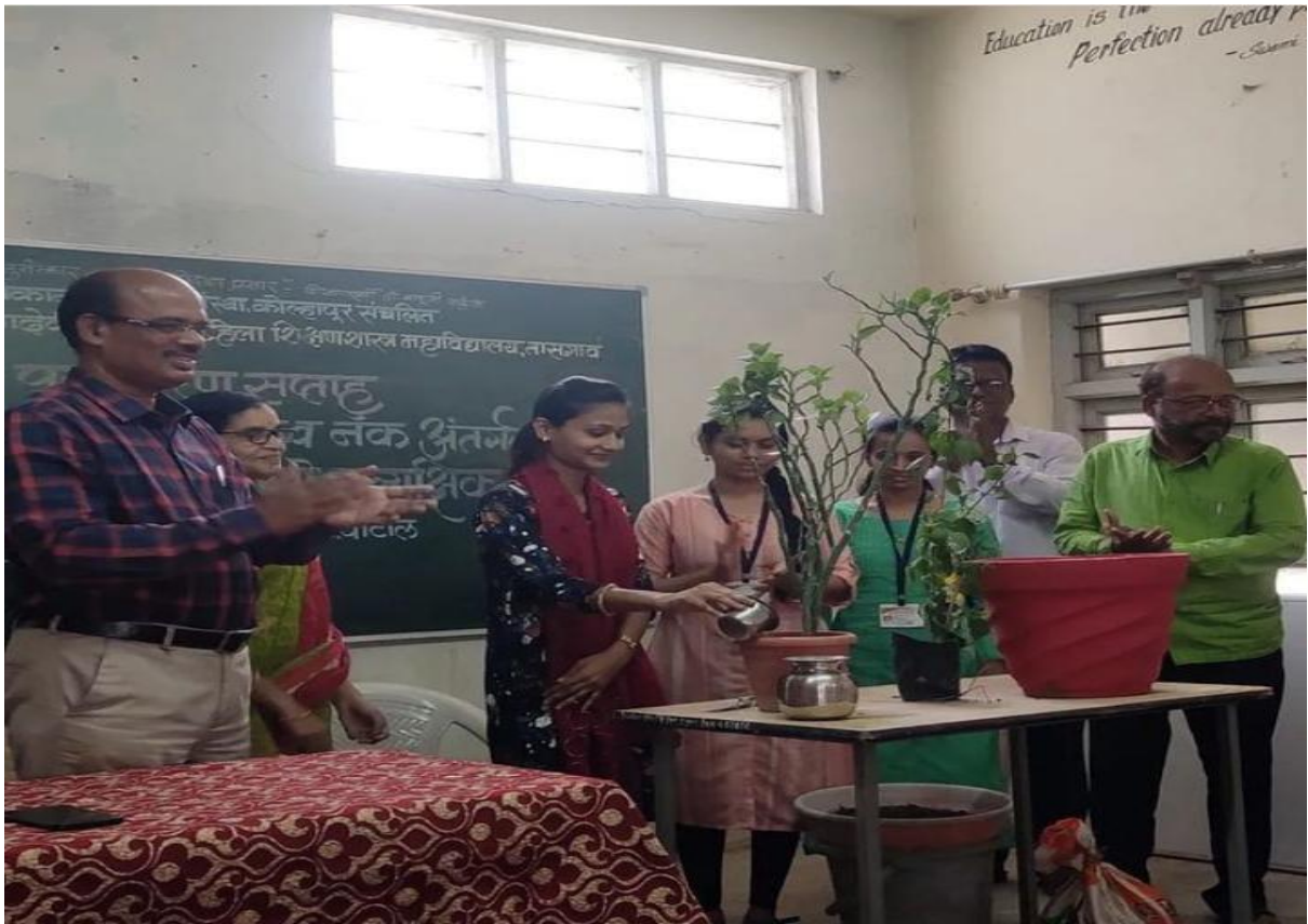
Sansthamata Sushiladevi Salunkhe Mahila Shikshanshastra Mahavidyalaya, Tasgaon Dist. Sangli